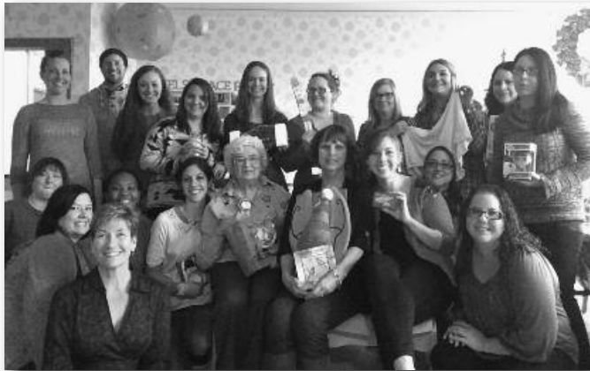
Happy New Year from the Angels' Place staff.

April 23 Purses for Change May 14 Highmark Walk for a Healthy Community August 24 Angels' Place Happy Hour at Franktuary October 20 Halo Award Dinner