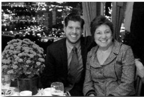
Halo Award door prize winner