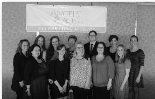
Angel's Place Staff