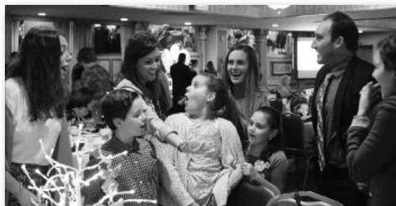
A magical night...