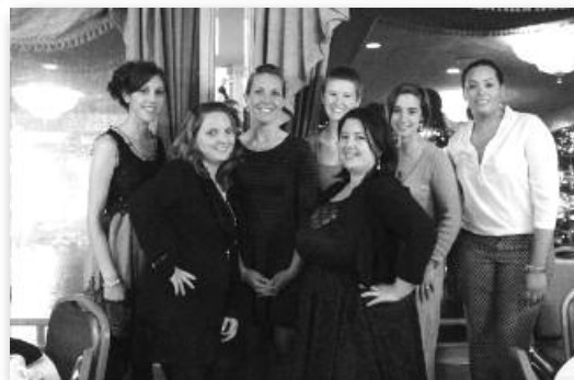
Swissvale teachers and parents