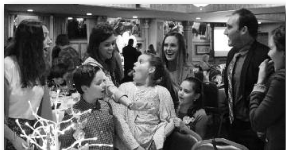
A magical night...