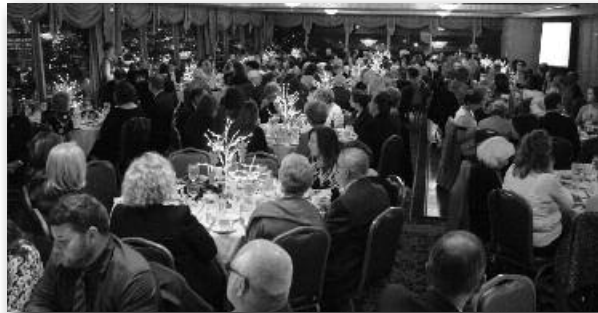
Full house of Angels' Place friends.