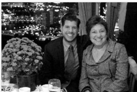
Halo Award door prize winner