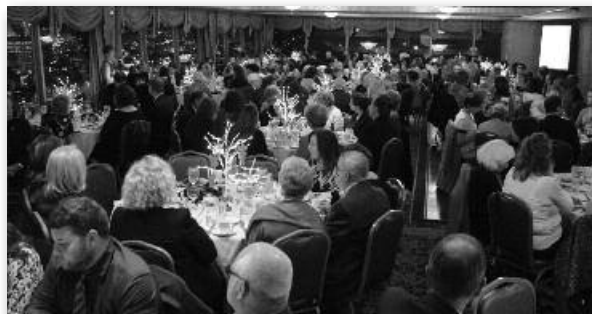
Full house of Angels' Place friends.