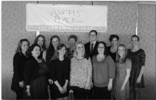
Angel's Place Staff