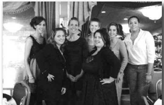
Swissvale teachers and parents