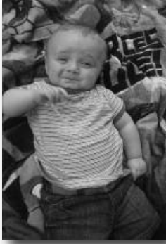
Brookline baby enjoying the great outdoors.